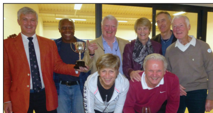
Some of the winning GB Vets team