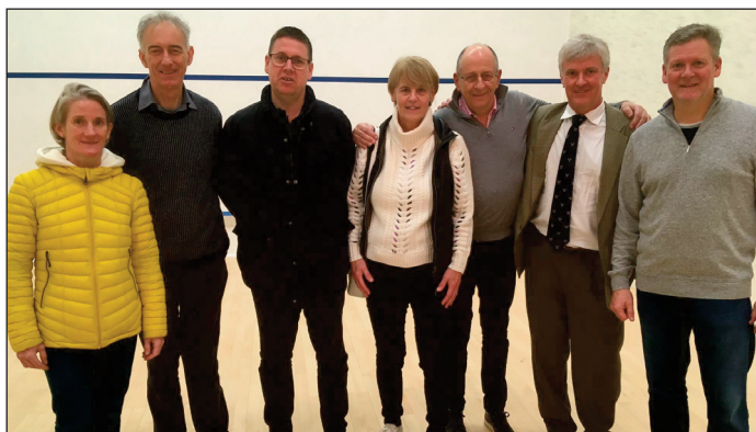
GB Vets team (part)