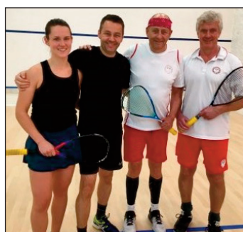
Robert Smith & Nick Sheppard (R)