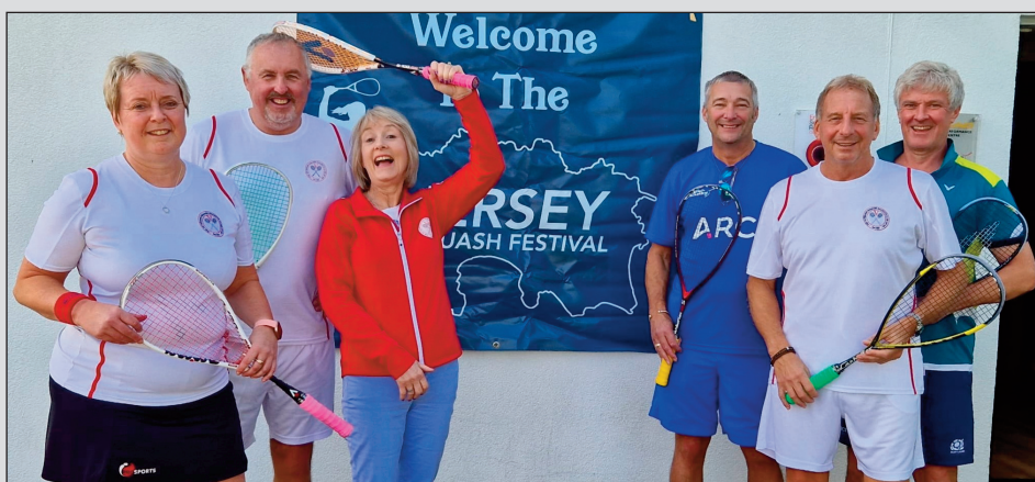
GB Vets Team