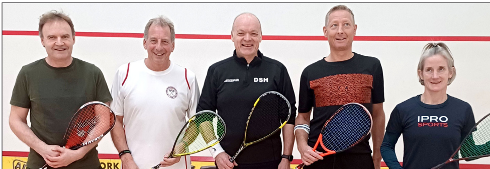
GB Vets Team