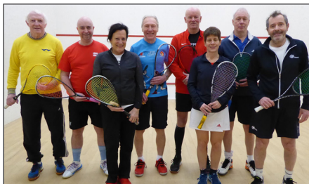
GB Vets team